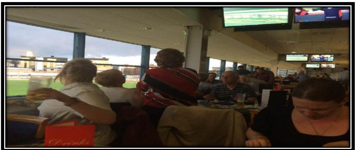
Enjoyed by all.