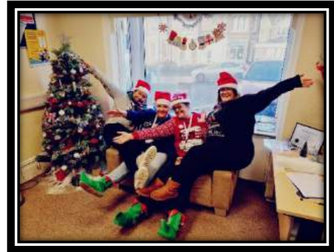
Senior Management came down to join in the Festivities for Christmas.